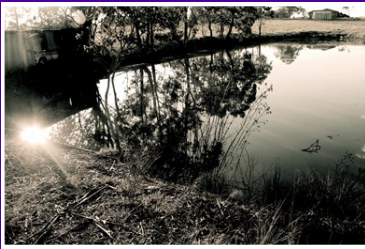
Landscapes by Brianna Aloisi

Year 11 Photography and Digital Media students have been exploring various genres within photography including Portraiture, Landscape and Still Life!