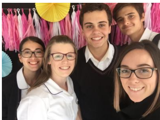
Just Leadership Day