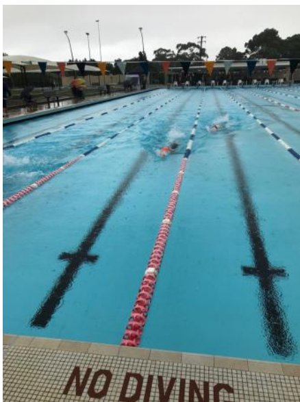
Swimming Carnival highlights