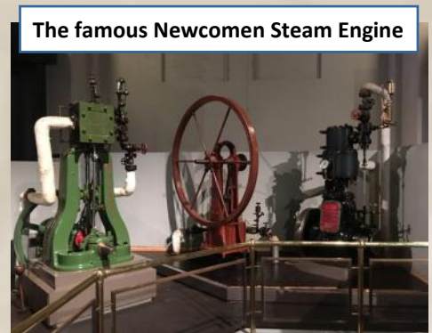
The famous Newcomen Steam Engine