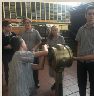
Operating a steam throttle, with the old destination board from Central Station in the background.