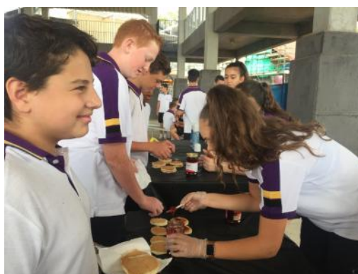
Shrove Tuesday Activity