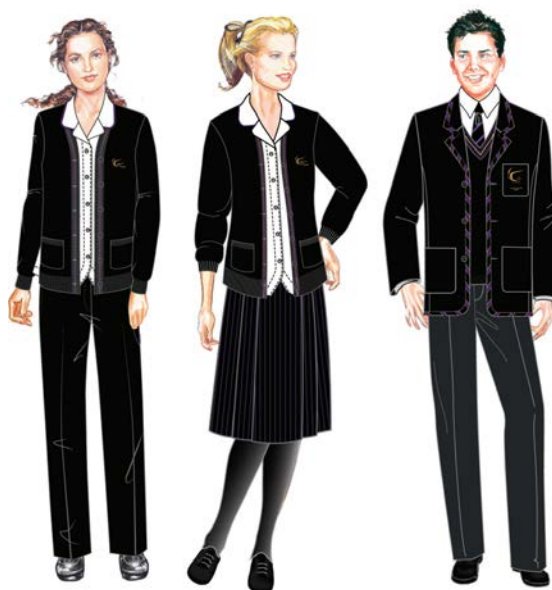
SENIOR WINTER UNIFORM