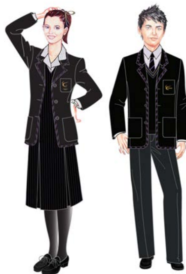
JUNIOR WINTER UNIFORM