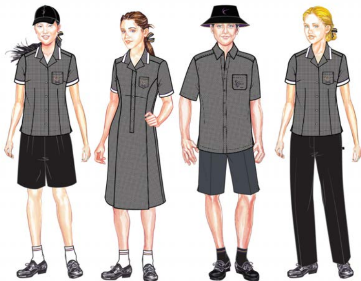
JUNIOR SUMMER UNIFORM