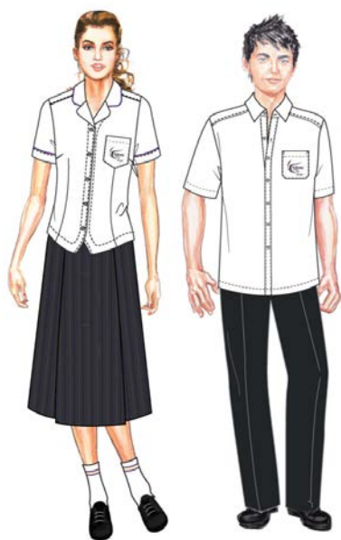
SENIOR SUMMER UNIFORM