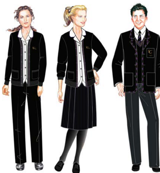
SENIOR WINTER UNIFORM