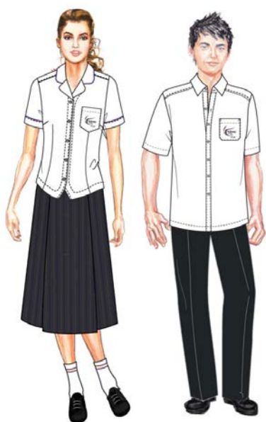
SENIOR SUMMER UNIFORM